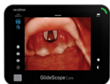
GlideScope Core 10