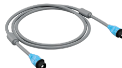
GlideScope Core QuickConnect Cable