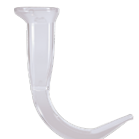
GVL 4 Stat

To learn more, visit verathon.com/glidescope